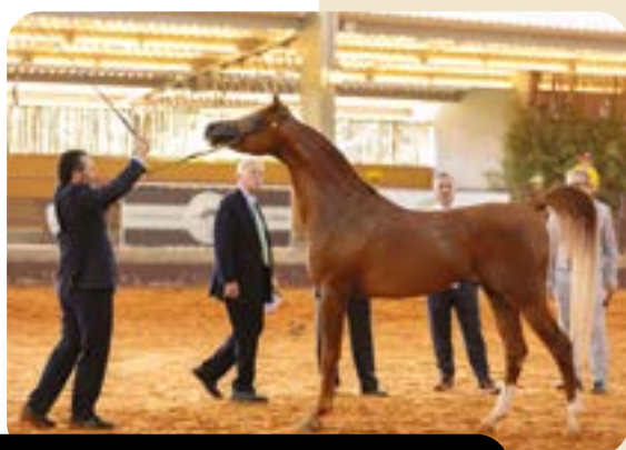
DAIMMEN HVP (NUZYR HCF X *MAQNA LEENDA HBV) 2021 INTERNATIONAL SILVER CHAMPION STALLION