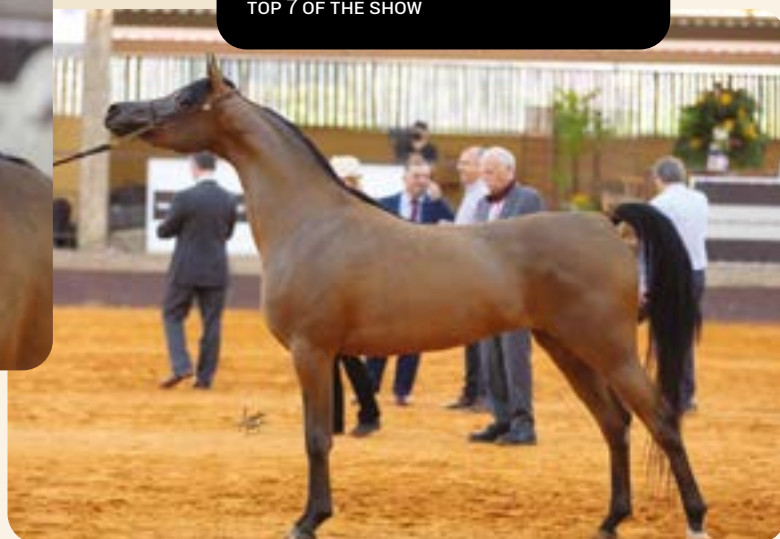
RFI RAFFAELLA (QUASIM CRH X *S RHAPSODY) TOP 7 OF THE SHOW

“... is also an ideal showcase for the breeders who wish to present the production of their sires.”