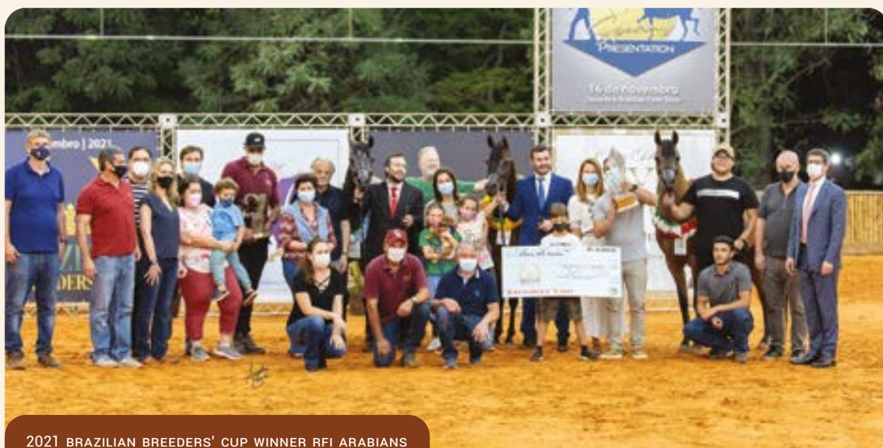
2021 BRAZILIAN BREEDERS' CUP WINNER RFI ARABIANS AND STALLION CUP WINNER QUASIM CRH.