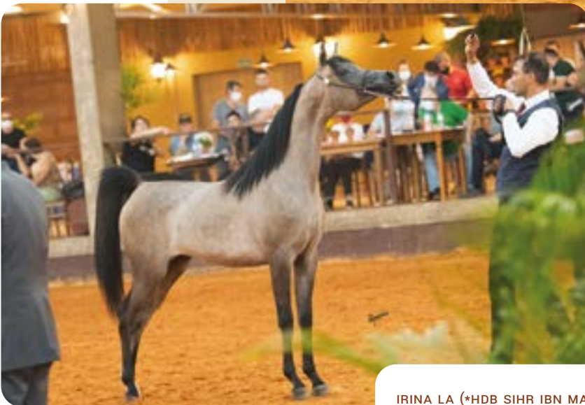
IRINA LA (*HDB SIHR IBN MASSAI X EMARWA MEIA) TOP 10 OF THE SHOW