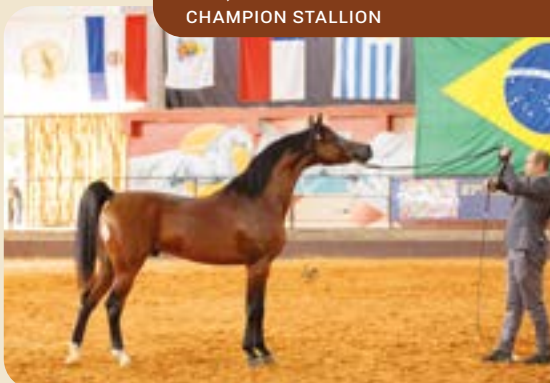
JUPITER RACH (*AAS-ELISHAHH X JASMIN FWM) 2021 INTERNATIONAL BRONZE CHAMPION STALLION