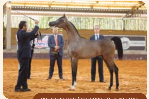
POLARHIS HVP (POLIDORO FC X *CHARIS RBV) 2021 INTERNATIONAL GOLD CHAMPION JR COLT

“There were many horses that would be more than competitive in the US or any other country.”