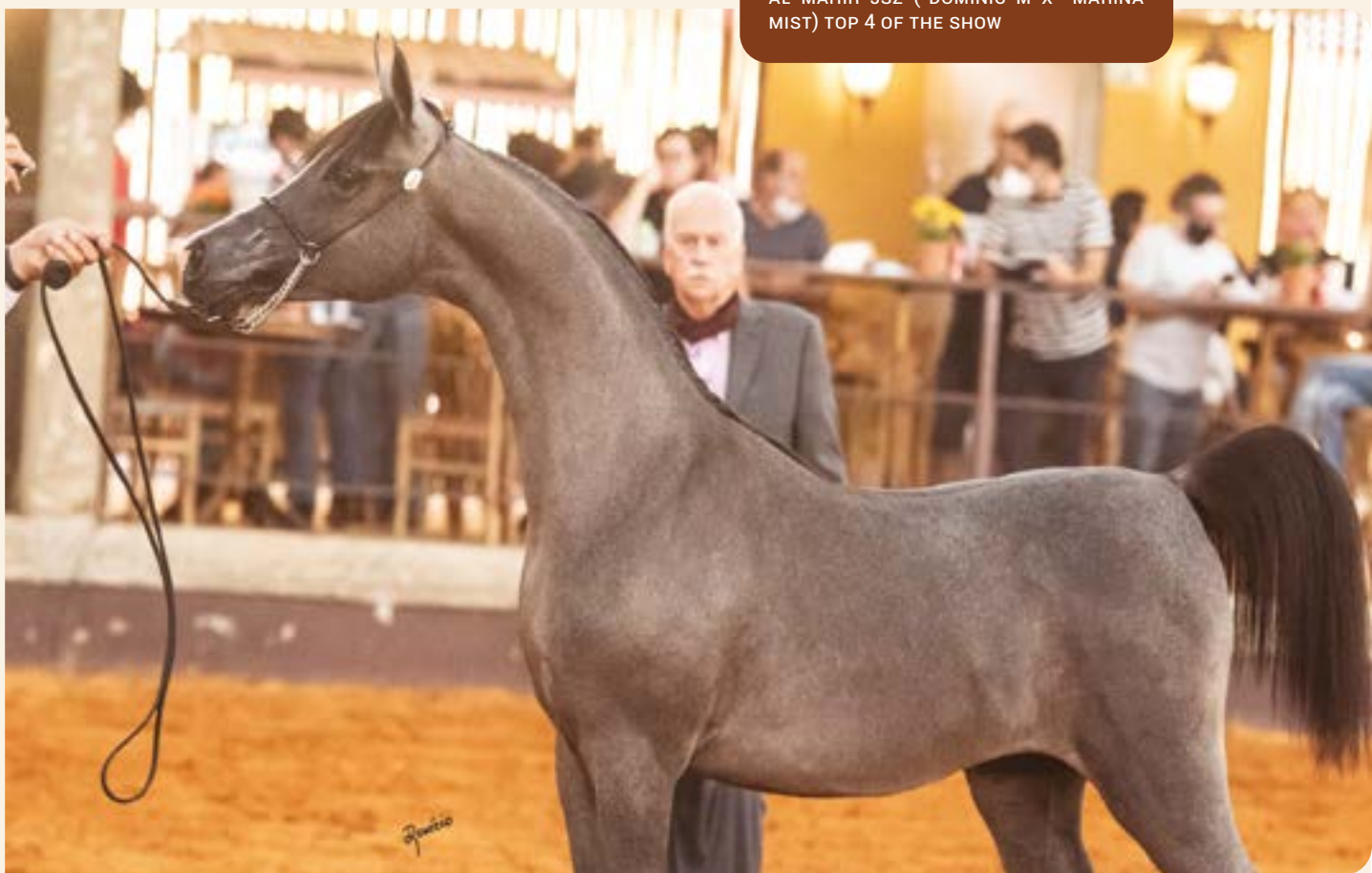
AL MAHIR JSZ (*DOMINIC M X *MARINA MIST) TOP 4 OF THE SHOW

in 2011, was won with a team of offspring of RFI Maktub. Thus, Quasim CRH, our main stallion at stud, shows us an important evolution of RFI Maktub, the stallion that had such an impact on our breeding. Furthermore, we were very happy that Quasim was awarded as the best stallion at the show, with the title of “Stallion Cup Champion”.