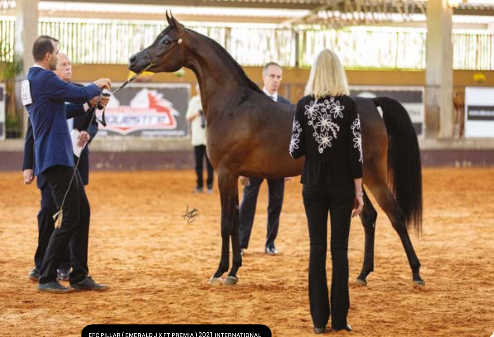
EFC PILLAR (EMERALD J X FT PREMIA) 2021 INTERNATIONAL GOLD CHAMPION FILLY

As we say goodbye to these amazing days of september, it is now time to look up for november, the highlight of the year and the bearer of our greatest show, the Brazilian Nationals. See you there!