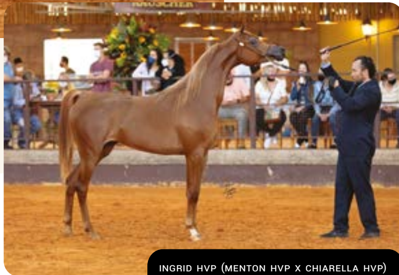
INGRID HVP (MENTON HVP X CHIARELLA HVP) 2021 INTERNATIONAL BRONZE CHAMPION FILLY