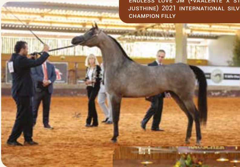
ENDLESS LOVE JM (*VAALENTE X STIG JUSTHINE) 2021 INTERNATIONAL SILVER CHAMPION FILLY