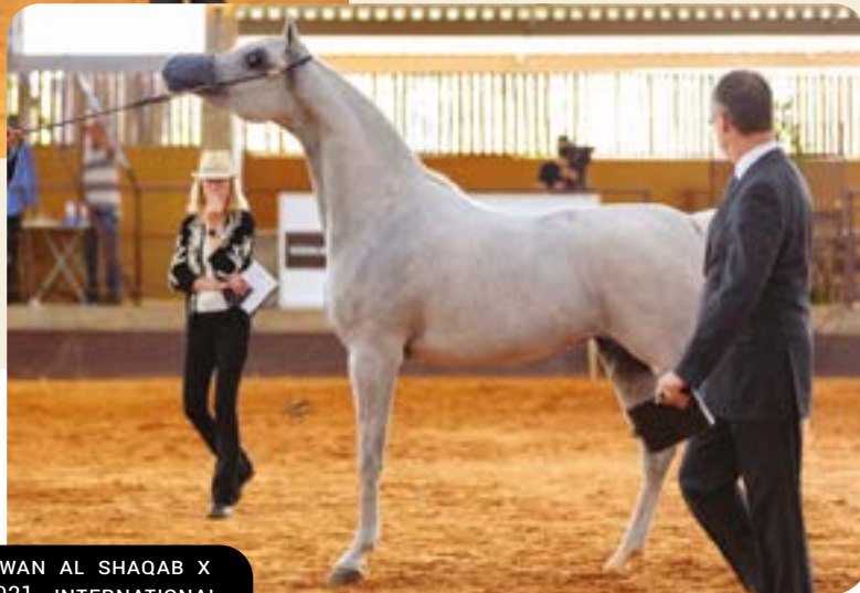
DOMITILA UB (MARWAN AL SHAQAB X *HB BESSOLEA) 2021 INTERNATIONAL BRONZE CHAMPION MARE

Shaqab daughter Monah HVP, bred and owned by Haras Vila dos Pinheiros and out of the DA Vinci FM daughter Monalisa HVP.