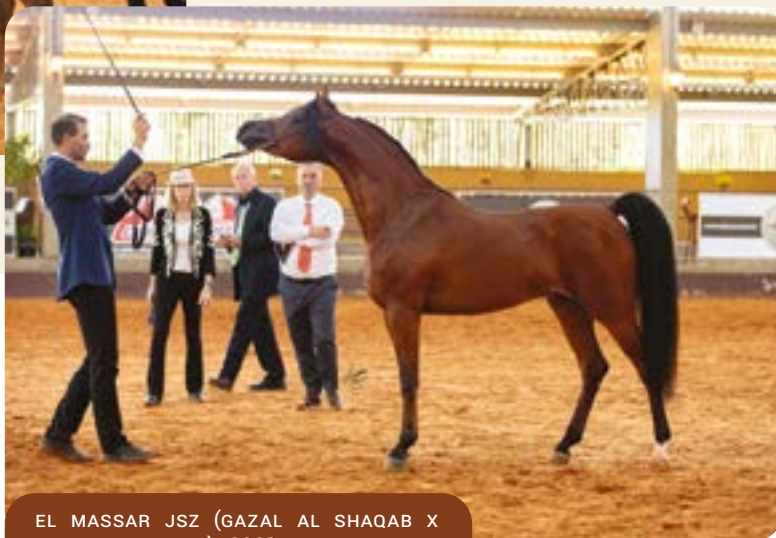
EL MASSAR JSZ (GAZAL AL SHAQAB X SAHARA GALLINA) 2021 INTERNATIONAL BRONZE CHAMPION COLT