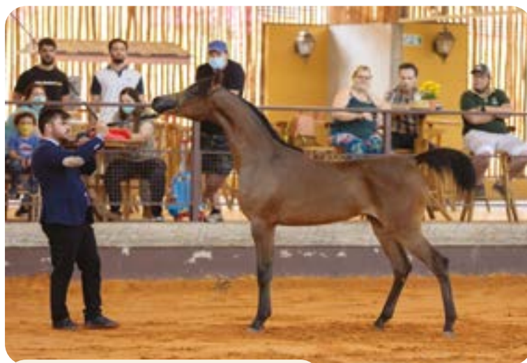
LP ELPHARA (*PRELUDIO OSB X STIG ZAPHYRA) 2021 INTERNATIONAL SILVER CHAMPION JR FILLY

I appreciate this opportunity and hope to keep following what is happening in Brazil.” (Note: freely translated from Portuguese).