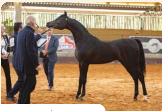
FIRENZE YPARADISE JM (YPARADISE JM X VIVAHRA D'YLLAN JM) 2021 INTERNATIONAL BRONZE CHAMPION JR COLT

judges, composed of good friends and people I admire.