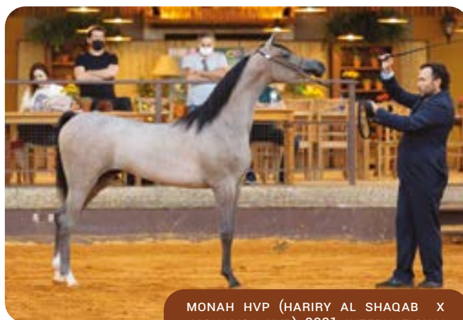
MONAH HVP (HARIRY AL SHAQAB X *MONALISA HVP) 2021 INTERNATIONAL BRONZE CHAMPION JR FILLY