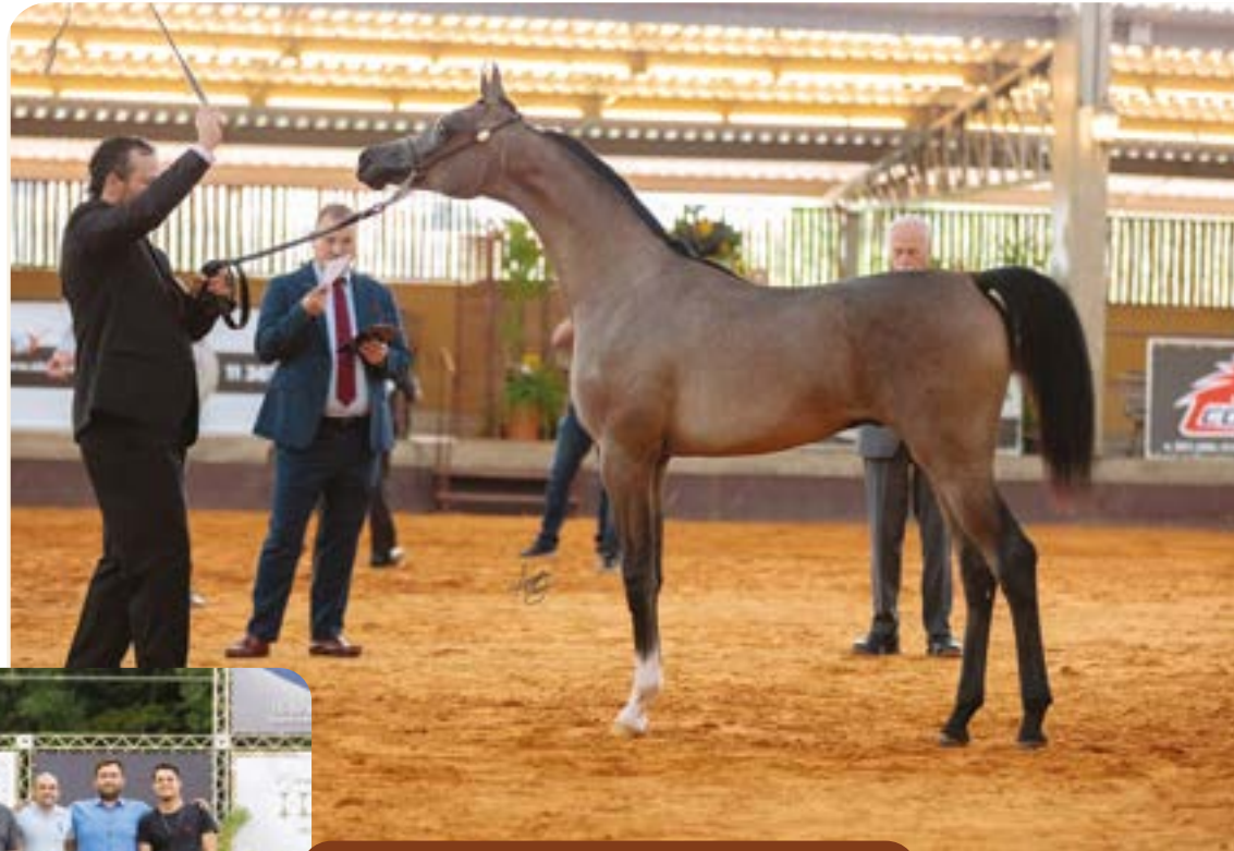
POLARHIS HVP (POLIDORO FC X *CHARIS RBV) 2021 PREMIUM CUP – HIGHEST SCORE OF THE SHOW